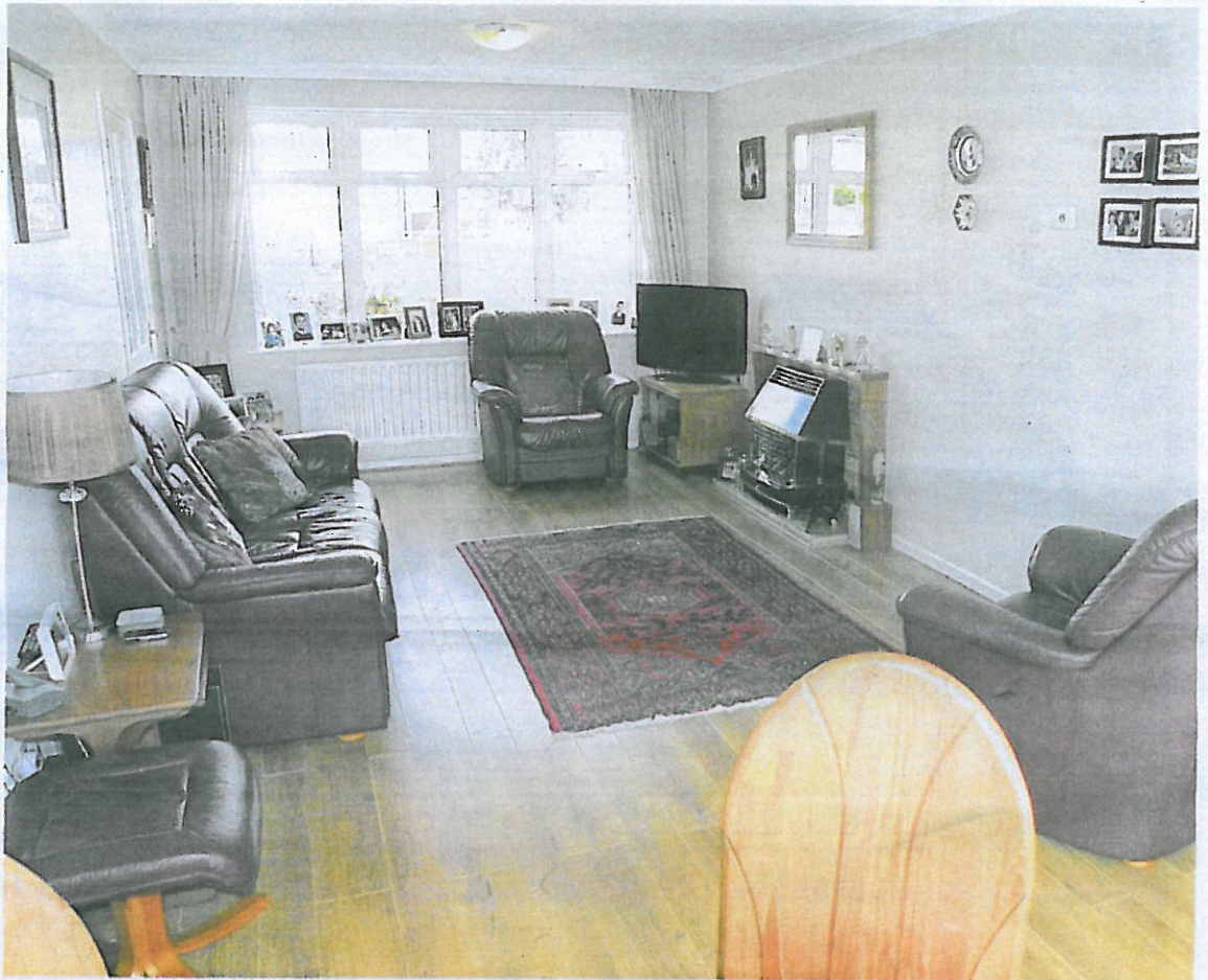
FAMILY SPACE: The living room at 49 Draycott Road, Sawley. Prospective buyers can view it at an open day on Saturday.

The house, which stands back from the road, is described by the selling agent as "an individual detached