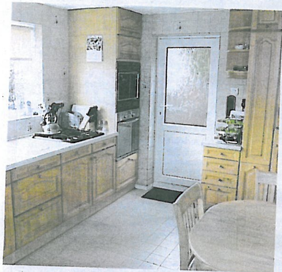
SMART DESIGN: The kitchen boasts integrated appliances.